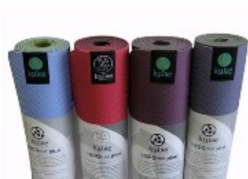
Kulae tpECOMat Plus

anywhere on your body, such as hidden inside a shirt pocket, placed in your handbag, or, even hung from your neck.