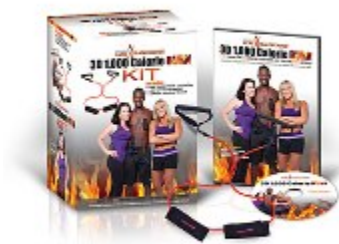
The CORE TRANSFORMER

Why we like it: One of the most distinctive exercise games out there is Get Fit with Mel B. (formally "Scary Spice" of the Spice Girls). The game actually places a mini real-life version of yourself standing and sweating side-by-side the Dancing with the Stars finalist. (You'll need the PlayStation Move with the PlayStation Eye camera—but it's so worth it!) Watching yourself exercise on screen is a great way to check your form as you go, plus, the game lets you incorporate your existing workout equipment (such as exercise and resistance bands) into your workout to make it even more challenging.