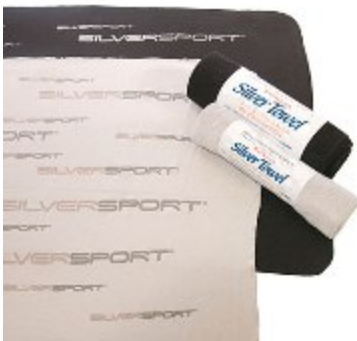
The SilverSport Silver Towel

Why we like it: Nike's new training app for the iPhone and iPod Touch has more than 90+ drill workouts for getting lean, toned, and strong—specifically for women. All you do is select your fitness goal and fitness level, then the app chooses the best selection of 15-minute, 30-minute, or 45-minute workouts for you to pick from (each designed by a Nike professional trainer). The app offers step-by-step instructions that anyone can follow and lets you listen to songs from your music library and hear the instructor at the same time. But best of all: the more you exercise, the more you unlock rewards, such as additional expert advice, celebrity workout regimes, and body-boosting nutritional recipes.