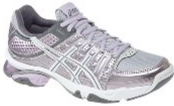
Asics GEL-Uptempo and GEL-Upshot Athletic Shoes