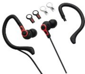
New Balance's NB439s 2-in-1 Sport Earbuds

Why we like it: One of the best health and fitness video games for the Nintendo Wii, the Biggest Loser Challenge guides users through more than 125 exercise exercises, ranging from warm-ups and cool-downs, core-strengthening moves, cardio boxing drills, yoga poses, and circuit training exercises. You can create your own custom fitness program, or, let the program think for you by selecting from one of ten preset fitness routines.