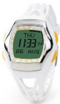
Sportline's DUO 1060 heart rate monitor

Why we like them: The problem with plastic water bottles is that many not only release harmful chemicals such as BPA's, but some are too narrow or difficult to wash properly. Lifefactory's sporty-stylish glass bottles feature a wide mouth (so it's super easy to clean), have a silicone sleeve that protects the bottle from breaking, and, you'll actually notice a fresher taste from your water (compared to drinking from a traditional water bottle). That difference alone can help you drink more—so you always stay well-hydrated as you exercise.