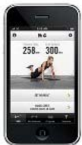
Nike Training Club App

Why we like it: We've seen medicine balls and stability balls , but this plush, weighted workout tool (picture a mix of half-beanbag/half-oversized stress ball that comes in 6-lbs, 8-lbs, 10-lbs, and 12-lbs versions) is an entirely unique exercise experience. The Ugi comes with a DVD that runs exercisers through a series of 30 different back-to-back exercises in a single 30-minute workout (there are 5 different workouts to choose from—150 exercises in all—so your body never gets bored of burning fat!).