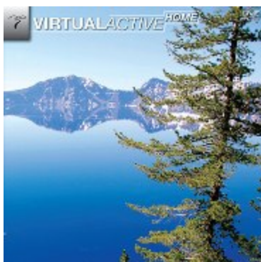
Virtual Active Workout Videos

Why we like them: Exercising with a kettlebell may be the latest fitness trend, but most are shaped like a mini-bowling ball with a handle attached to them, making them more uncomfortable on your wrists and forearms during certain moves. This kettlebell is ergonomically-designed with grooves that let the weight comfortably rest on your arms as you exercise. We also like the DVD workout that guides even the exercise novice through an easy-to-follow, full-body 30-minute routine.