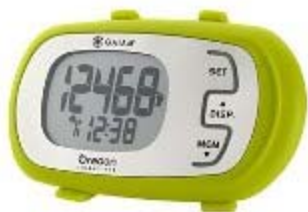
Gaiam's Calorie Coach

Why we like it: This baby-soft sports towel is more than just gentle on your skin when you're wiping off perspiration; it's made from a technology that uses nano-silver particles that actually eliminate more than 650 types of surface-borne, odor-causing bacteria. It's also made with a super soft bamboo that's three times more absorbent than cotton, so you'll never need another towel to dry off with, no matter how long you exercise.