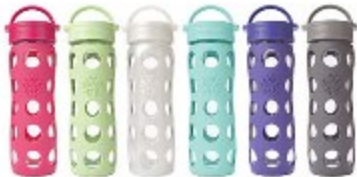
Lifefactory Water Bottles

Why we like them: To be able to tackle any type of exercise, you need a training shoe that offers your feet stability from any angle, shock absorption from heel to toe, and a breathable mesh upper that lets your dogs air out as you work out. Both the Uptempo and Upshot offer a superior mix of cushioning, traction, and support, all in a lightweight pair of shoes with a sock-like fit that almost makes you forget you're wearing them.