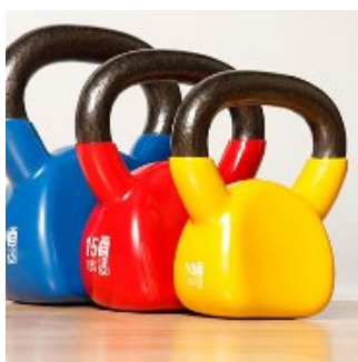
Bob Harper's Contour Kettlebells

Why we like it: This comfy eco-friendly yoga mat has many of the benefits you might expect from being 100% biodegradable, latex-free to prevent allergic reactions, and sporting a germ- and bacteria-resistant surface (so it always smells fresh). But what makes this mat a cut above others on the market is the simple fact that it's also four inches longer than a standard yoga mat—making it ideal for bodies of all sizes.