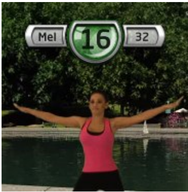
Get Fit with Mel B. Fitness Program for the PS3

Why we like them: If you've ever felt like a hamster on a wheel when exercising indoors on a treadmill or bike, these DVDs offer an actual "eye view" perspective of what it would be like to exercise along 200-plus of the most scenic jogging and cycling trails throughout North America. Each 35-minute workout lets you choose between being coached by a trainer (who pops up on the screen and tells you how to adjust your workout) or you can go solo and simply enjoy the view as you sweat.